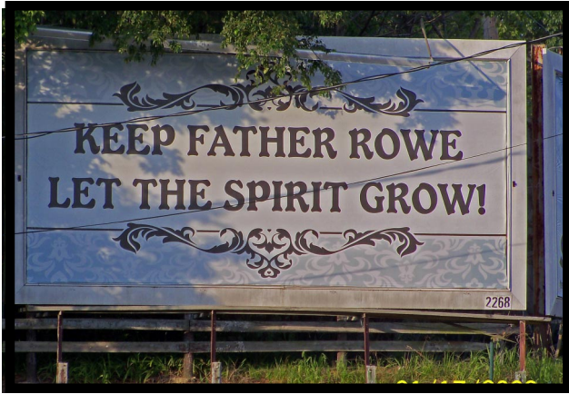
Billboard at Centerville Ave. and South Belt Line, Belleville